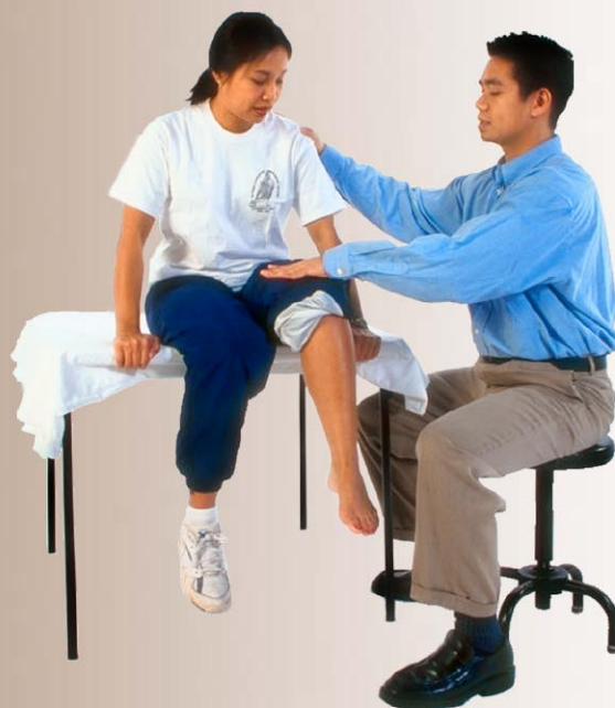
Health & Medical