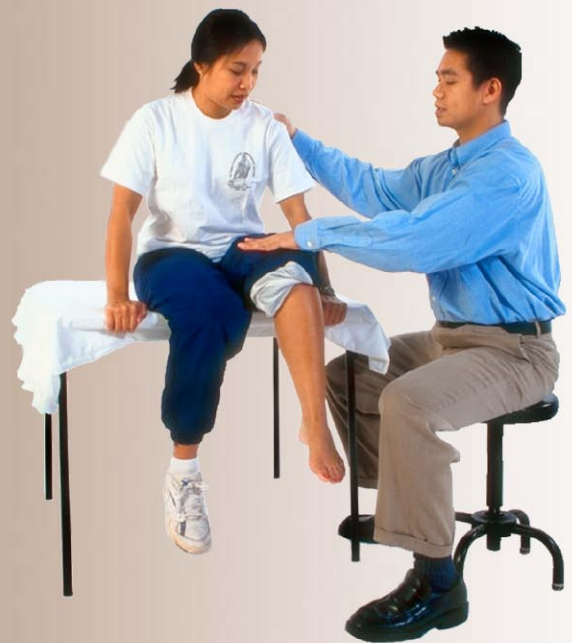
Health & Medical