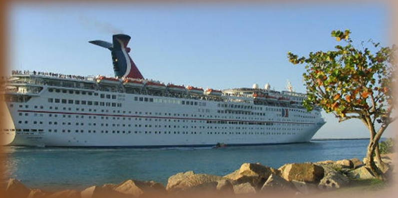
Vacation & Holiday